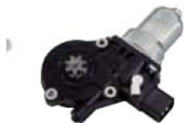
Power window motors

87. Power Window Motors are small electric motors used to raise and lower vehicle windows. A type of Power Window Motor manufactured by Mitsuba is shown below.